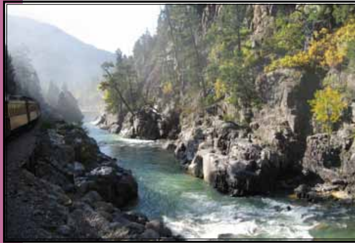
First Place: "Animas River Train" by Ann Bowen

The judges were unanimous in their choice. Judges said: "I can picture the excitement of this train ride," and "Very nice dynamic shot. The diagonals in the mountains and in the stream, together with the jagged rocks, reinforce the feeling of action conveyed by the train and the rushing water."