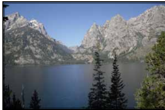
Second Place: "Grand Tetons" by Peg Lawrence

The judges were unanimous in their choice. Judges said: "I can picture the excitement of this train ride," and "Very nice dynamic shot. The diagonals in the mountains and in the stream, together with the jagged rocks, reinforce the feeling of action conveyed by the train and the rushing water."